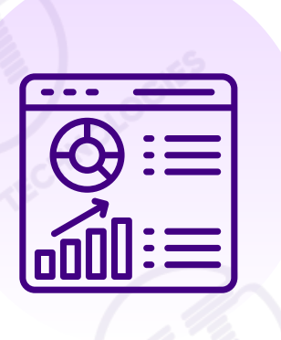
Data Dashboards Maps & Charts